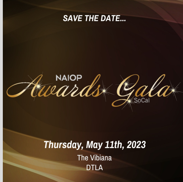
NAIOP SoCal: Awards Gala Thursday, May 11th, 2023 The Vibiana, DTLA