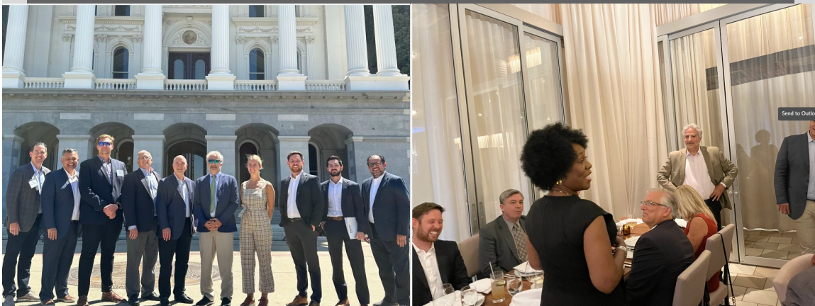
NAIOP SoCal Delegation Advocates on State Legislative Priorities at