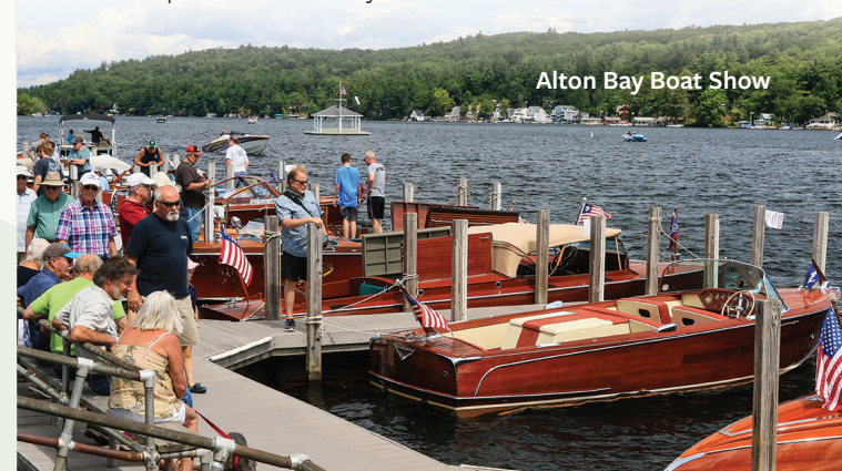
Alton Bay Boat Show

A special sweet thank you to all our dedicated volunteers.