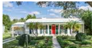
45 NE 104TH ST