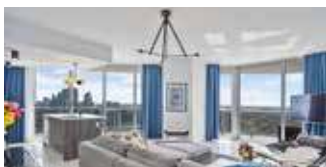
121 NE 34TH ST, PH3216