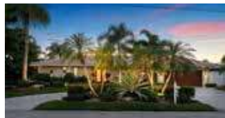
4411 NE 27TH AVE