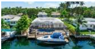
1343 NE 104TH ST