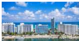
5055 COLLINS AVE, 8J