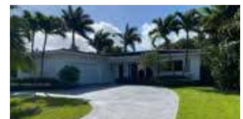
1240 NE 93RD ST