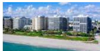
9559 COLLINS AVE, S3-F