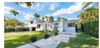
9824 NE 5TH AVE