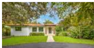
1163 NE 101ST ST