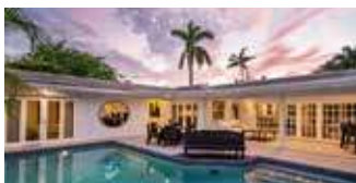
1361 NE 103RD ST