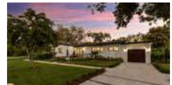
496 NE 88TH ST