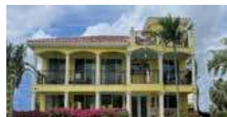
1125 NE 89TH ST