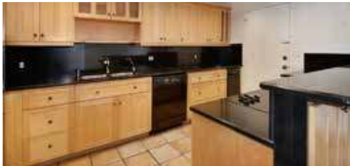
9111 E. Bay Harbor Dr. #PHE $499,500

Beautiful Spacious 2BD/2BA split bedroom at The Palm Bay Yacht Club! Features include a remodeled kitchen w/ PHENOMENAL SOUTH VIEWS of the bay, pool & tennis courts.