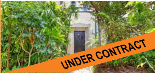
1344 Euclid Ave. #1 $549,000

LOCATION, LOCATION, LOCATION! On one of Miami Shores most beautiful streets close to the Bay, this classic MIMO style Miami Shores ranch is 2,158 SF.