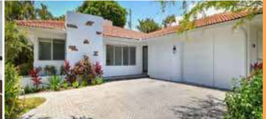
1290 NE 100th St. $1,699,000

BEAUTIFULLY REMODELED 3 BEDS/ 3 FULL BATHS corner Rotunda at The Cricket Club with HIS & HERS full master bathrooms and walk-in closets! This 2,320 sf unit has been completely remodeled.