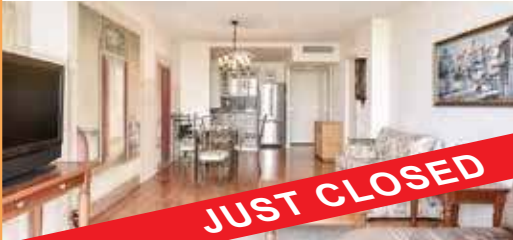
780 NE 69th St. #2006 $335,000

SPACIOUS & WELL-KEPT 3 beds/2 baths + DEN plus a Florida Room in a great location! Features include a spacious floor plan, a master suite with huge walk in closet, open and well-kept kitchen.