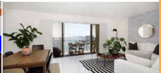
11111 Biscayne Blvd. #21C $429,000

Beautifully remodeled spacious 2BR/2BA split bedroom layout in the desirable Palm Bay Yacht Club! Feat. incl. an updated kitchen w/ rich wood cabinets & granite countertops.