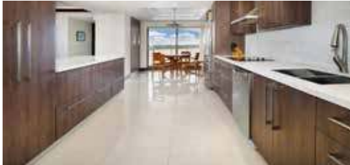
1800 NE 114th St. #1209 $599,000

BREATHTAKING PANORAMIC VIEWS OF THE BAY AND BEACHES from this 1BR/1.5BA condo in the desirable Palm Bay Yacht Club. Features include an exquisite new open kitchen.