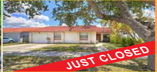
12764 SW 9th Ter. $556,000

This rare historic home is zoned residential and commercial giving this property unlimited possibilities. Built in 1921 and hidden behind privacy walls, this home is one of a kind in the heart of Coconut Grove.