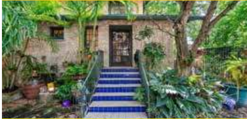
3041 Oak Ave. $2,000,000

CASH BUYERS ONLY. Charming & spacious 2BD/2BA unit in Miami Beach! Recently updated, features include a remodeled kitchen w/ newer appliances and granite countertops.