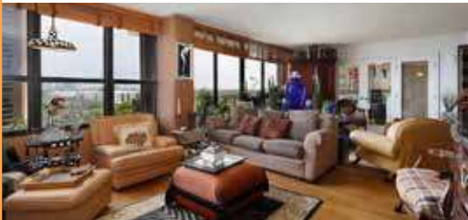
780 NE 69th St. #905 $379,000

EXQUISITE PANORAMIC VIEWS OF THE WIDE BAY & all of Miami Beach from this charming 2 bed/2 bath condo at The Jockey Club.