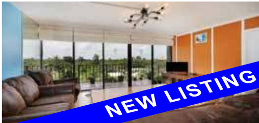
780 NE 69th St. #408 $329,000

Imagine your own dream home in the center of SOBE with your OWN PRIVATE BACKYARD & a 1 CAR GARAGE!!! This rare old Spanish gem does exist and is a charming 2/2 CORNER lot.