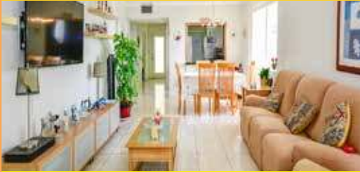
8001 Crespi Blvd. #5B $255,000

CASH BUYERS ONLY. Charming & spacious 2BD/2BA unit in Miami Beach! Recently updated, features include a remodeled kitchen w/ newer appliances and granite countertops.