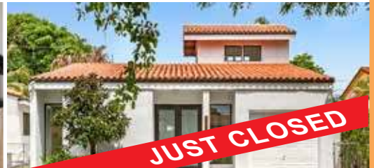
4269 SW 13th St. $1,160,000

This Penthouse unit has west views and is a spacious 2 bedroom, 2 bathroom split plan with 1,576 SF of living space plus a spacious balcony. Rich wood floors with Mahogany borders.