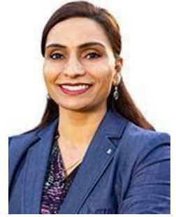
Harwinder Sandhu, MLA Vernon-Monashee