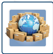
Small Package Shipping & Courier