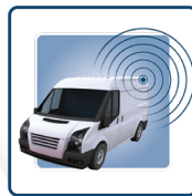
Electronic Logging Devices