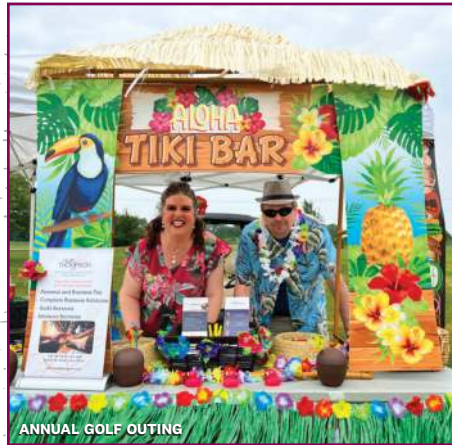
ANNUAL GOLF OUTING