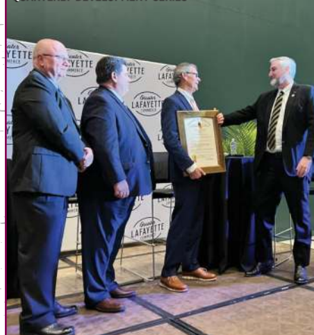
QUARTERLY DEVELOPMENT SERIES