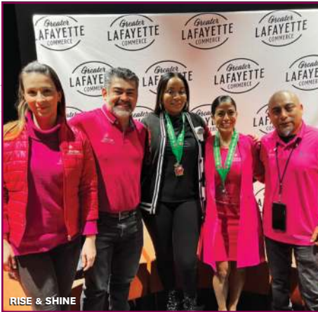
RISE & SHINE

Being part of Greater Lafayette Commerce means being part of something bigger - a network of businesses and organizations looking to grow, market their products and services, connect with each other and future clients, gain resources and share knowledge. Greater Lafayette Commerce members are passionate about the Greater Lafayette Region and are invested in its growth and success!