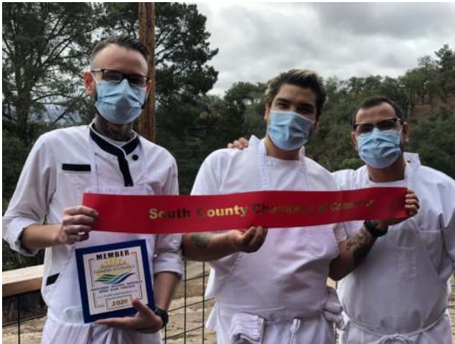
Chef Antonio's Italian Kitchen 250 Wesley St. in Arroyo Grande (Camp Arroyo Grande) chefantonios.com • (805) 260-8660