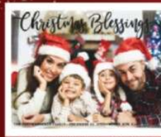
CANVAS WRAPS / PHOTOS

618 E. GRAND AVE, ARROYO GRANDE, CA 93420