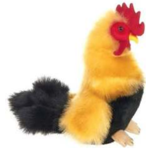
Look for this rooster toy in the Village to participate in the scavenger hunt.

Rooster Scavenger Hunt: There is an additional opportunity to win a prize if you post a photo with the stuffed rooster toy that will be hidden in a Village business and include the hashtag and tags of the Elegant Christmas promotion. Winners will be announced every Sunday in December on the