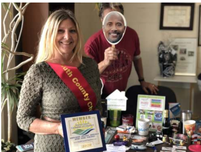
SLOCO Data & Printing 1635 W. Grand Ave. in Grover Beach slocoprinting.com • (805) 481-5990

Chamber member SLOCO Data & Printing celebrated a ribbon cutting to celebrate the new promotional item division of their business. They now offer an extensive range of promotional products and business gifts. Some of the most popular branded items include masks, hand sanitizers, pens, tumblers, mugs, and PopSockets. SLOCO Data & Printing is a multi-service company offering graphic design, printing, direct mail, database services, promotional marketing items, and real estate information. Large-format printing is also available. Their office is located in Grover Beach at 1635 W. Grand Ave., Suite A. For more information, please visit slocoprinting.com .