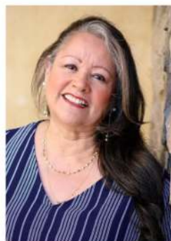
PLUS PROPERTY MANAGEMENT