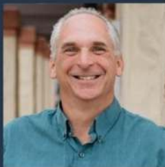
Mayor Jeff Lee Grover Beach