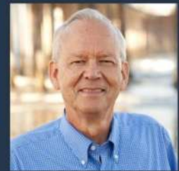
Mayor Ed Waage Pismo Beach