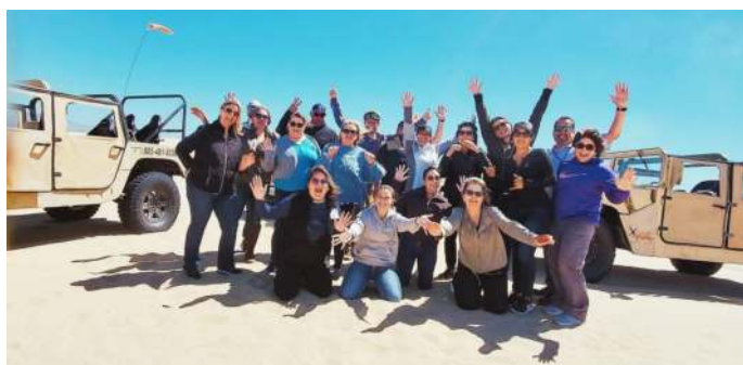
South County Chambers' Leadership Class III learned about effective communication, local tourism, and state parks at their day session last month.

PISMO BEACH — The City of Pismo Beach extended the application deadline for their scholarships to help struggling families pay for summer camps. The grant funding, available through the Pismo Beach Childcare Assistance Grant Program, will help Pismo Beach residents meet immediate financial needs due to COVID-19 impacts. Scholarships will lower the cost of summer camps to just $50 per camp, and the City will cover the remaining balance. Applicants must be a Pismo Beach resident. Click here to learn more and apply.