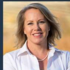
Mayor Caren Ray Russom Arroyo Grande