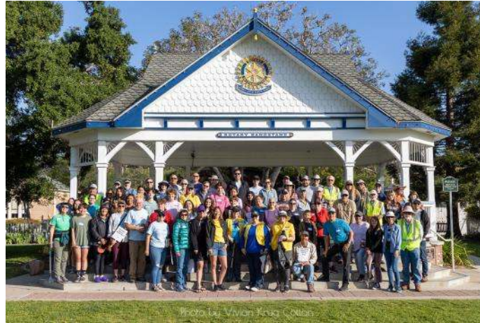
More than 100 volunteers participated in community beautification and cleanup projects during We Heart AG last month.

County: As part of a legal settlement, the Board of Supervisors voted on April 18 to select a new fair and lawful district map that ensures all county citizens have an equal voice in our local democ-