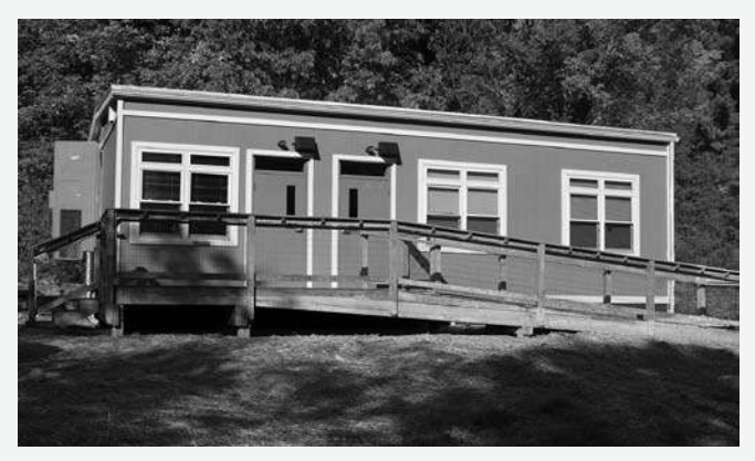
Waldorf School, Charlottesville, VA