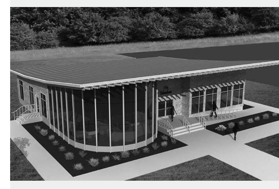
MBI's student design competition offered a challenge to architecture students for a real-world scenario. The winning entry (pictured here) came from Tyler Stanley of Ball State University. The senior community center's green features include: Low to no emitting materials; no VOC paint and carpets; double-pane, low E windows; sound absorbing gypsum for reduce noise pollution; LED lighting and low-energy appliances; and, a vegetative roof.

The winning entry, pictured here, was submitted by Ball State architecture student Tyler Stanley. Stanley's 4,900-sf design capitalizes on some of the greenest aspects of modular construction: use of recycled materials and reduced waste from off-site construction.