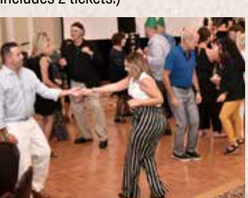
PLUS PROFESSIONAL DJ