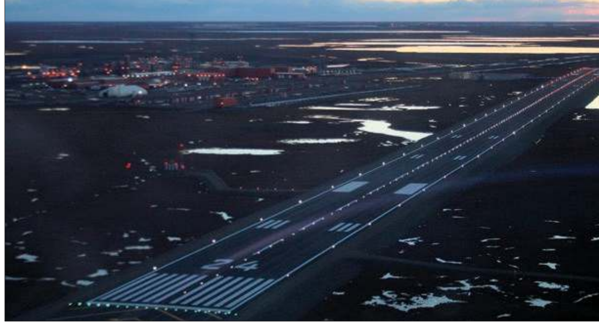
Kuparuk Airfield, Granite Construction

Most of the uncertainty in the forecast this year is in the oil and gas sector. We assume that the oil and gas companies will be largely successful in carrying out the plans they have announced for the year. 5 But plans can and do change, because of many factors associated with weather, logistics, availability of supplies, evaluation of work completed, regulatory and environmental challenges, prices of oil and gas, and other operational and strategic concerns. The continued uncertainty about the future direction of state petroleum tax policy, possible new energy policy initiatives put forward by the second Obama administration, and the prospects for construction of a gas pipeline to commercialize North Slope gas add a cautionary note not only