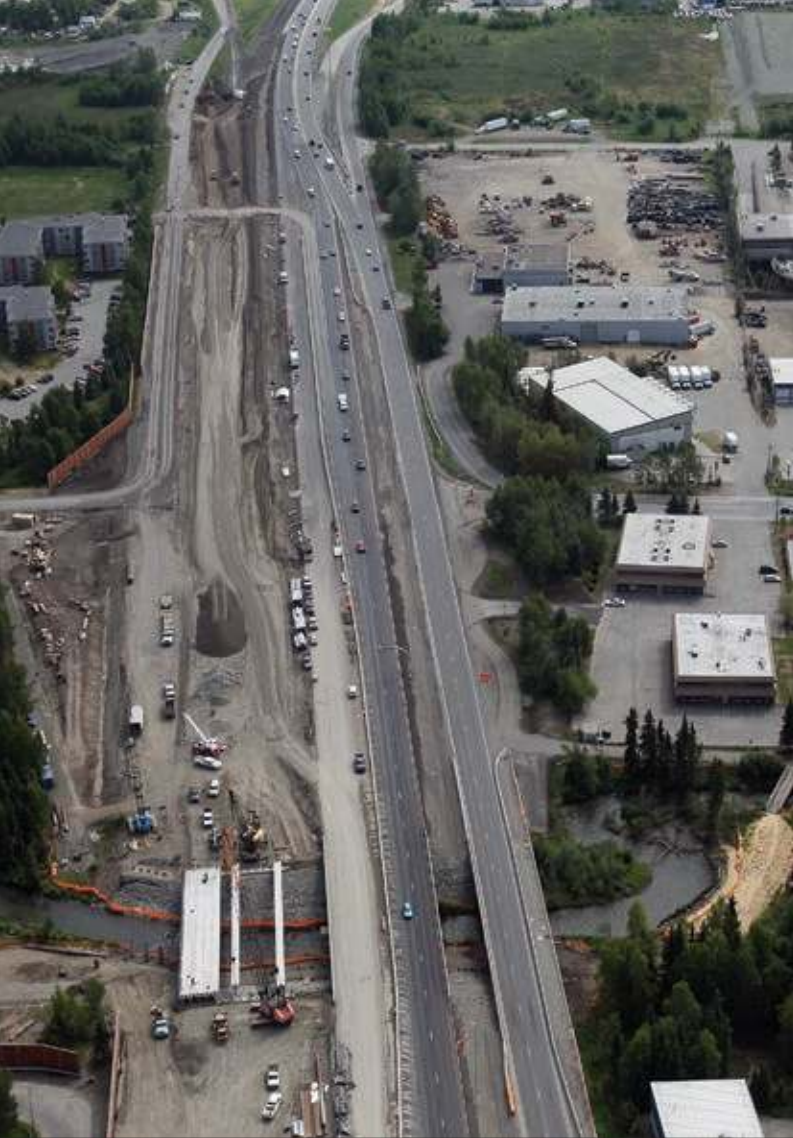
Seward Highway Reconstruction, Anchorage, QAP

big jump this year. The budget for MILCON (military spending for facilities on bases), which was only $33 million last year, is forecast to be $103 million. Funding includes seven new projects at Fort Wainwright, of which the largest is a $36 million warm-storage hangar. The environmental program budget, including FUDS (Formerly Used Defense Sites), will also be larger, at $127 million in 2014. This program includes cleanup of hazardous substances and contaminants at former defense sites as well as on current Army and Air Force installations.