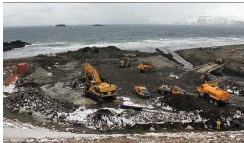
Akutan Airport, Kiewit Infrastructure West