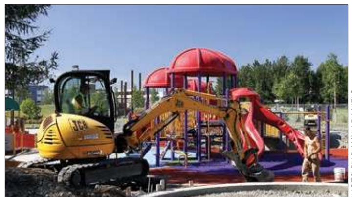
Cuddy Park Playground, Anchorage, JTA Construction