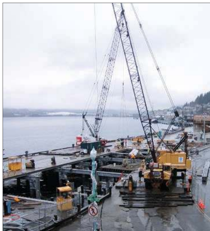
Ketchikan Berth I and II Rehabilitation, Orion Marine Contractors