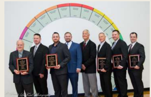
2019 DSA Winners

Nominations are now being accepted in these categories: