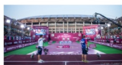
Hyundai World Cup Final Sept 29-30