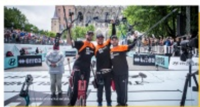
Hyundai World Archery Championship Sept 24-26