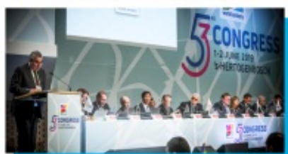
World Archery Congress Sept 16-18