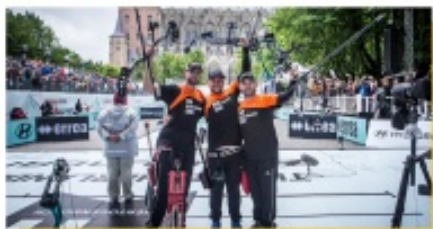
Hyundai World Archery Championship Sept 24-26