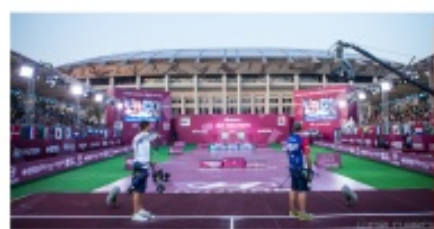
Hyundai World Cup Final Sept 29-30