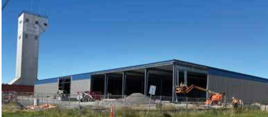
Under construction: a new 50,000 sq ft manufacturing facility in west Rome for Cold Point Corporation, recognized industry-wide as the premier supplier of OEM (original equipment manufacturer) style replacement units.

(See pages 30-33 for more details about Griffiss Business and Technology Park.)