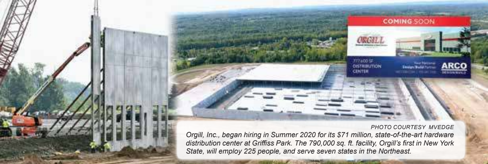
Orgill, Inc., began hiring in Summer 2020 for its $71 million, state-of-the-art hardware distribution center at Griffiss Park. The 790,000 sq. ft. facility, Orgill's first in New York State, will employ 225 people, and serve seven states in the Northeast.