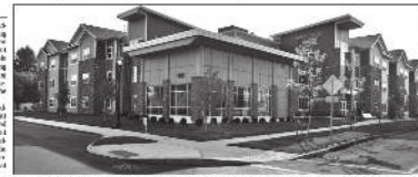
PROJECT RENDERING — The new affordable housing project, located on the former site of the former Rome Air Development Center, will consist of 100 units of affordable housing. The project is expected to be completed in 2022.

BY JENNIFER CLEGG Staff Writer The Rome Area Housing Authority (RAHA) has been selected by the New York State Office of General Services (OGS) to develop and manage a new affordable housing project in Rome. The project, located on the former site of the former Rome Air Development Center, will consist of 100 units of affordable housing. The project is expected to be completed in 2022. The project is a significant milestone for the RAHA, as it marks the first time the authority has been selected by the OGS to develop and manage a new affordable housing project. The project is also a significant milestone for the Rome community, as it will provide much-needed affordable housing for the area's residents. The project is a result of a partnership between the RAHA and the OGS. The RAHA is responsible for the development and management of the project, while the OGS is responsible for providing the funding for the project. The project is expected to be completed in 2022. The project is a significant milestone for the RAHA, as it marks the first time the authority has been selected by the OGS to develop and manage a new affordable housing project. The project is also a significant milestone for the Rome community, as it will provide much-needed affordable housing for the area's residents.