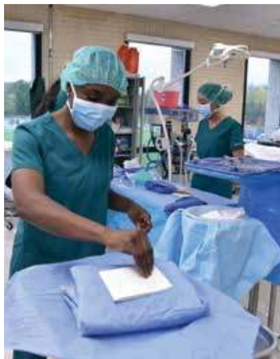
Surgical technician in operating program at MVCC.

Cornell Cooperative Extension of Oneida County offers many programs, classes and information, including Child Care Resource and Referral (where people can find child care), classes in subjects as agriculture, master gardeners, volunteer opportunities, child care provider certification including health and safety, child development and more, outreach to schools, online opioid prevention and 4-H.