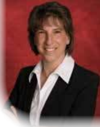
Jacqueline Izzo, Mayor City of Rome

Economic development remains a top priority for the City of Rome, with continued improvements made possible City-wide through aggressive pursuit of grants and private investment. Here is an overview from Mayor Izzo's recent 2020 report: