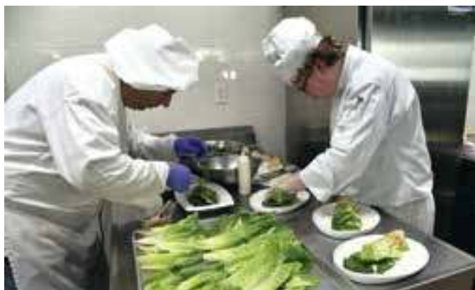
Hospitality program at MVCC

Mohawk Valley Community College (MVCC) is New York's first community college, the first community college in New York state to be an Achieving the Dream™ Institution, and offers innovative and affordable education for all students. With campuses in Rome, Utica, and online, MVCC offers more than 90 associate's degree and certificate programs, job placement and transfer assistance, professional development and workforce training, community education, championship athletics, events, and much, much more. The $30 million renovation at the MVCC's Plumley Complex on the Rome campus provides premier classroom and conference space, and state of the art facilities for its Hospitality and Surgical Technology programs. 1101 Floyd Ave., Rome NY 13440, (315) 334-7709 www.mvcc.edu .