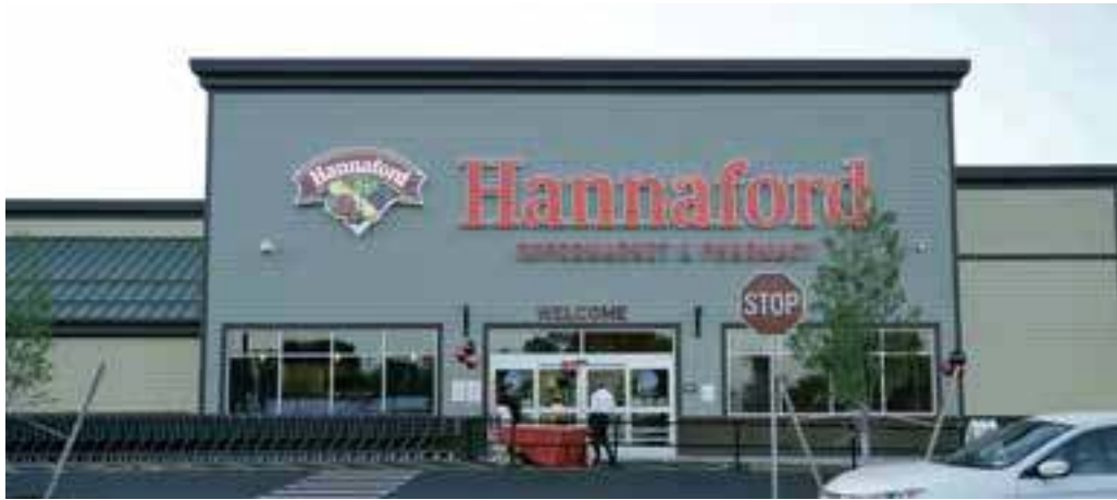
Summer 2020: A new Hannaford Supermarket and Pharmacy, the chain's largest at 49,000 sq. ft., opened in North Rome.

Gotta love it. Gotta live it. Really. Positively... Rome!