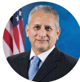
Schertz Mayor RALPH GUTIERREZ