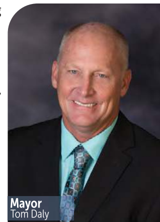
Mayor Tom Daly