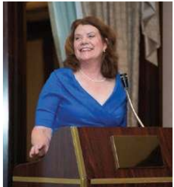
Hon. Lori Sigurdson, Minister of Seniors & Housing