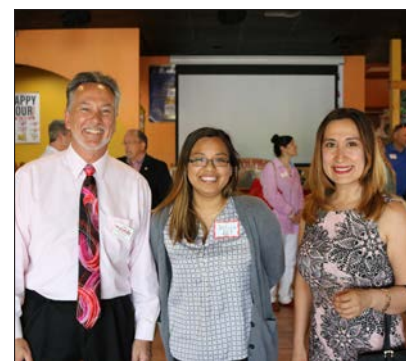
Community members attended the second Hispanic Coalition Gathering, hosted by Los Toletcos.