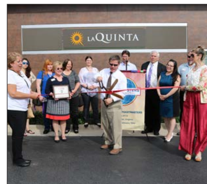
Congratulations to Winchester Toastmasters on their 25th Anniversary ribbon cutting at La Quinta Inn & Suites Winchester.