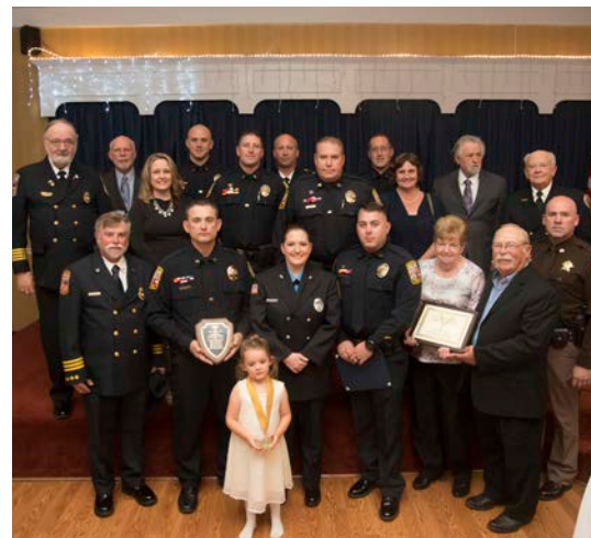
2018 Valor Award winners.

The Valor Awards are sponsored by City National Bank, Bank of Clarke County, Miller's Supplies at Work and Louvre Media.