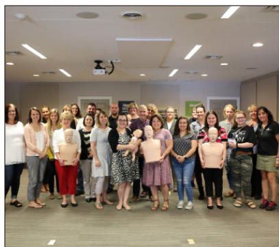
Valley Basic Life Support CPR and AED Training, hosted by YHB. Participants learned the importance of saving a life.