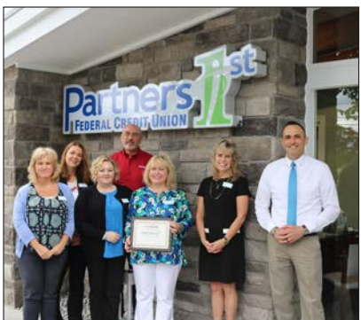
Congratulations to Partners 1st Federal Credit Union on their ribbon cutting! Located at: 3143 Valley Ave.