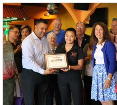
Congratulations to Los Toletcos on their ribbon cutting! Located at: 1046 Millwood Pike.