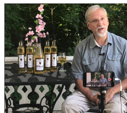
Behind the scenes with Misty Mountain Meadworks as they film their Member Spotlight film with Louvre Media.