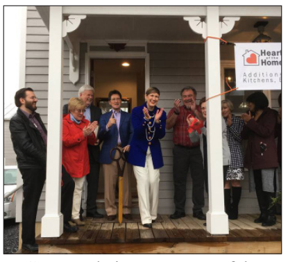
Congratulations to Heart of the Home Design-Build on their ribbon cutting!