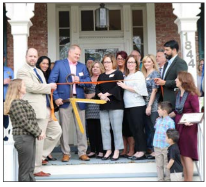
Congratulations to Right at Home on their ribbon cutting! 1844 Valley Ave., Winchester