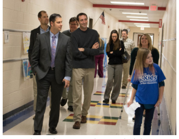
CLP Class of 2017 touring Frederick County Public Schools for Education day.