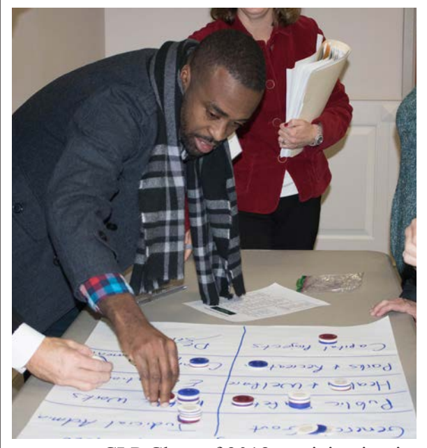
CLP Class of 2018 participating in Government Day.