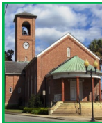
c. 1881 First Presbyterian Church ♦ 121 South 2nd St, Palatka Romanesque Revival style, clock & bell tower topped with a hipped roof.