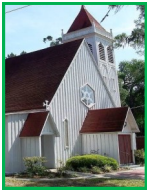
c. 1854 St. Mark's Episcopal Church ♦ 200 Main St, Palatka The oldest religious building in Palatka. Occupied by Union Soldiers during the Civic War.