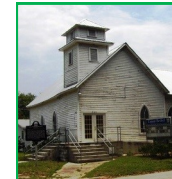
c. 1890 Union Bethel African Methodist Episcopal Church ♦ 200 N Cedar St, Crescent City Services began in 1890, after the building was moved from another site to this location. Nationally renowned labor organizer A. Philip Randolph attended here while his father was the preacher.