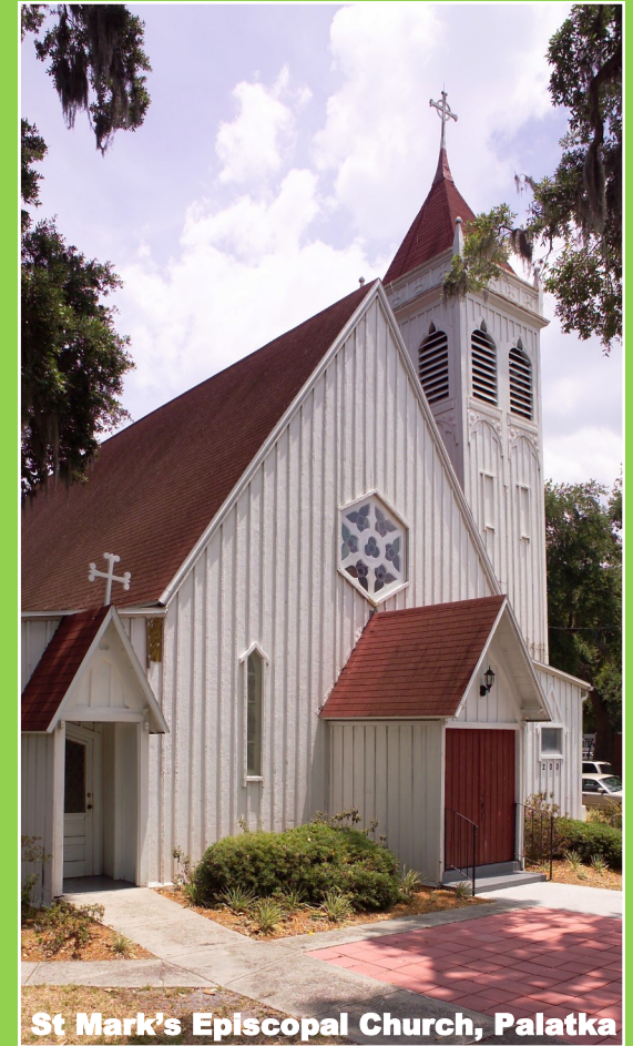
St Mark's Episcopal Church, Palatka