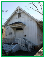
c. 1883 St. Mary's Episcopal Church ♦ 809 St Johns Ave, Palatka Gothic Revival style, features board & batten siding, lancet windows and curvilinear trim at the gable ends.