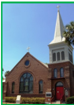
c. 1897 St. Monica's Catholic Church ♦ 114 South 4th St, Palatka 3rd oldest church in St Augustine Diocese. Romanesque Revival style, masonry walls are highlighted by semi-circular arched windows. The fixed stained-glass windows are splendid works of art. A square bell tower supports an inspiring metal shingle-clad spire. Parapets rise on the east & west gables.