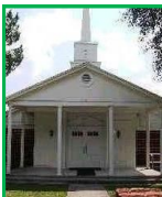
c. 1852 Peniel Baptist Church ♦ 5227 Silver Lake Dr, Palatka Vernacular with drop-lap siding & corner boards, common to rural churches during this era. Best noted for the Baptism & Ordination of Evangelist Billy Graham, who conducted services on several occasions in 1938-39.