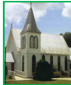
c. 1876 Episcopal Church of the Holy Comforter ♦ 223 N. Summit St, Crescent City Carpenter Gothic style, narrow lancet windows, high pitched roof with exposed rafters and batten exterior siding.