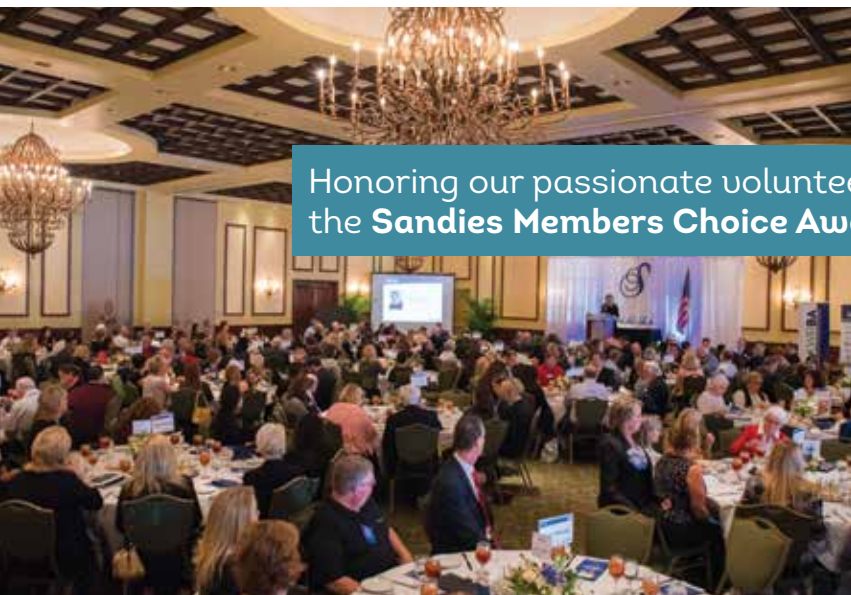
Honoring our passionate volunteers at the Sandies Members Choice Awards