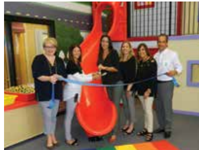
Doodle Bugs! Children's Learning Academy

Visit our website's Member Directory to learn more about these new businesses.