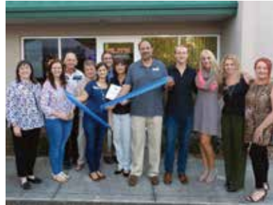
Elite Laser Engraving