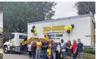
MI-BOX Gulf Coast