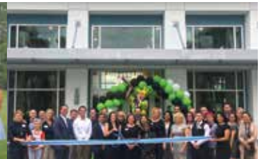
Residences at the Green