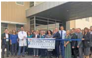
Florida Cancer Specialists Lakewood Ranch Cancer Center