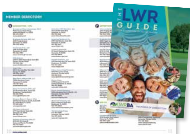
*2019 Edition Pictured

As a member of the Lakewood Ranch Business Alliance, you have the exclusive opportunity to put your business in the hands of 10,000+ locals and visitors with an ad in our LWR Guide! As a benefit of membership, all members receive one FREE business listing.