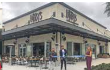
Libby's Neighborhood Brasserie Lakewood Ranch