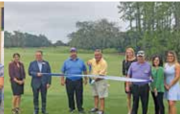
The Concession Golf Club - "The Gimme" Course