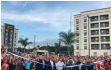
Comfort Inn & Suites - Sarasota Gateway Hotels

Visit our website's Member Directory to learn more about these new businesses.