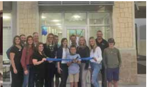
Hornback Chiropractic & Wellness