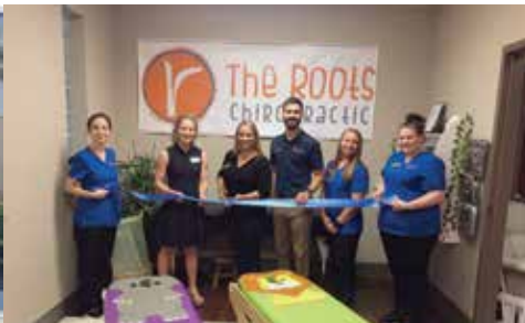
The Roots Chiropractic