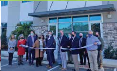
SunCoast Blood Centers

Visit our website's Member Directory to learn more about these new businesses.