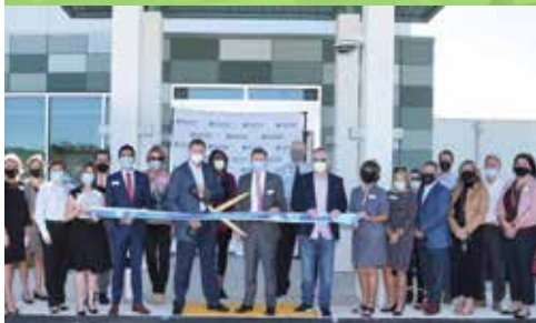
LWRMC ER at Fruitville