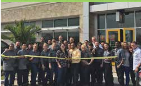
California Pizza Kitchen