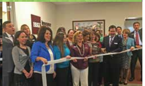
BB&T Insurance Services