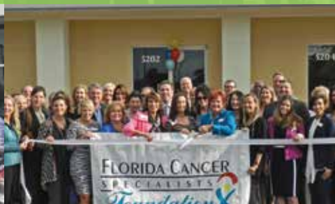
Florida Cancer Specialists Foundation