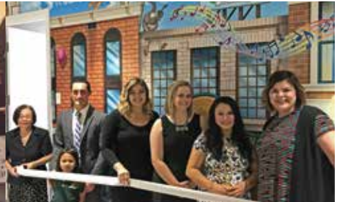
Little Town Smiles