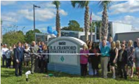
R.E. Crawford Construction

Visit our website's Member Directory to learn more about these new businesses.