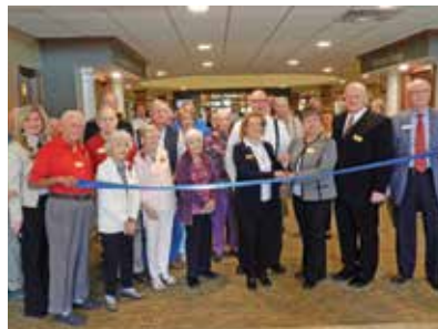
Stone River Retirement Community

Visit our website's Member Directory to learn more about these new businesses.