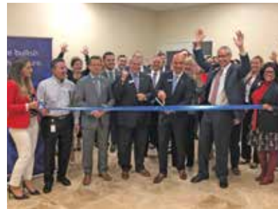
Bank of America - Merrill Lynch