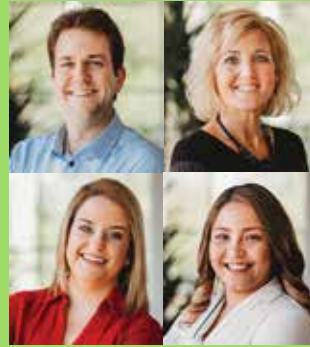
Our Staff Lakewood Ranch Business Alliance