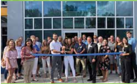
Brain & Body Chiropractic Clinic - Affiliate of The Wellness Way