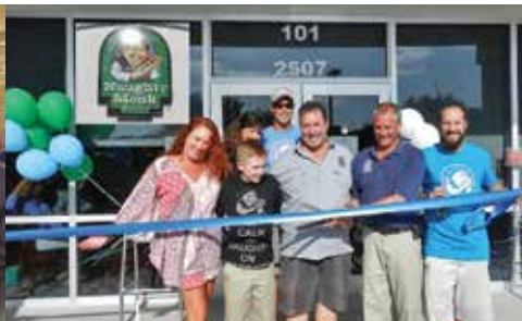
Naughty Monk Brewery