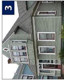
110 17th Street VICTORIAN BEACH COTTAGE Homes often shared similarities with other Victorian buildings, particularly in the use of wood ornamentation around the porches and gable ends.