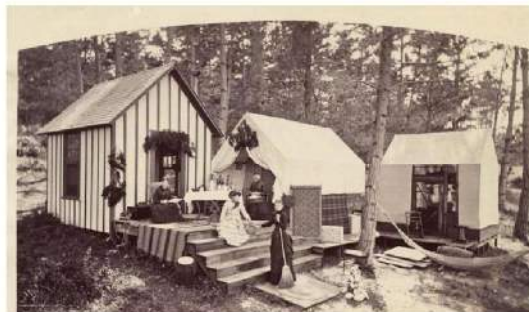
Views of tents and cottages, 1885.