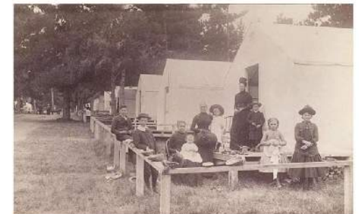
Tent city along 16th Street, 1880s.