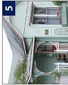
588 Central Avenue "KIT HOUSE" Inside out homes were ready-to-assemble and sold through mail order companies such as Sears, Roebuck & Co. They arrived by train and were brought to the site by wagon. Noticeable fastening bolts can be seen on the corners.