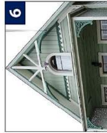
137 16th Street GOTHIC Homes feature steep roofs with projecting stick work, irregular composition, lancet windows, trefoil and quatrefoil porch trim, and board and batten siding.