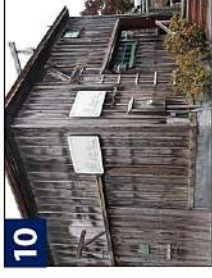
605 Laurel Avenue BOARD AND BATTEN This design is typified by wide vertical wood siding with the vertical joints covered by much narrower wood boards called battens.