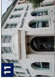
574 Lighthouse Avenue ROMANESQUE Features include simulated sandstone block siding and brick construction of unreinforced masonry. Entryway columns are often a feature of this style. This building is the best example on the Monterey Peninsula.