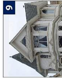
649 Lighthouse Avenue QUEEN ANNE Homes display a variety of decorated porches and eaves, gables, towers and turrets, bay windows, stained glass, and patterned shingles. Structures vary greatly in size and design.