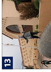
165 Forest Avenue SPANISH/MEDITERRANEAN REVIVAL Features are whitewashed stucco, low pitched tile roofs, arched openings, balconies, and wrought iron window grills.