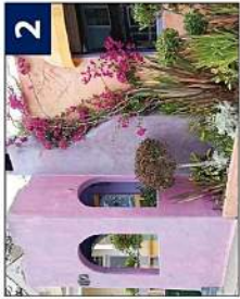
110 Forest Avenue PUEBLO REVIVAL These earth colored buildings feature flat roofs, low parapet walls above the roofs, projecting wood beams, and rounded windows. The attempt was to capture the appearance of the adobe structures of the Southwest.