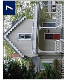
129 Pacific Street GOTHIC REVIVAL Also called Carpenter Gothic, this style originated in England in a revolt against the rigidity of classical forms. Homes feature irregular composition, steep gable roofs, trimmed porches and board and batten siding.