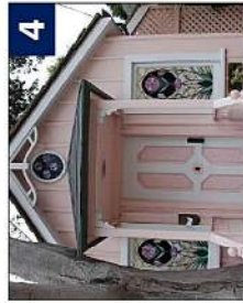
133 17th Street FOLK VICTORIAN Cottages often shared similarities with other Victorian buildings, particularly in the use of wood ornamentation around porches and gable ends.