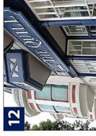
541 - 553 Lighthouse Avenue VICTORIAN COMMERCIAL Victorian commercial storefronts feature bay windows, ornamentation, and the use of a variety of colorful paint.