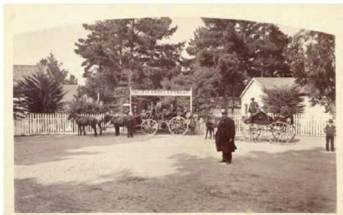
Retreat office and stile gate entrance at Lighthouse and Grand Avenues, 1885.

By 1889 the Methodist resort was incorporated, becoming the City of Pacific Grove with a population of 1300 permanent residents. Over the years Pacific Grove has grown from an area of one square mile to 2.6 square miles with a population of approximately 16,000. As you tour the city and some of its homes and commercial buildings, take note of the individuality, the uniqueness of each, and the variety of architecture.