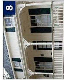
139 19th Street VERNACULAR Vernacular applies to traditional American architecture built with a combination of memory of eastern forms, local needs and traditions, and availability of materials. Elements consist of double hung sash windows and wood siding.