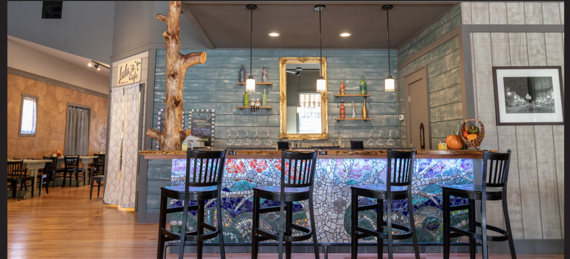
EATING OUT IN JACKSON COUNTY DINING GUIDE