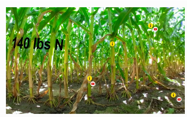
This image is from an <u>interactive tool</u> that allows you to explore a U of M on-farm nitrogen trial.