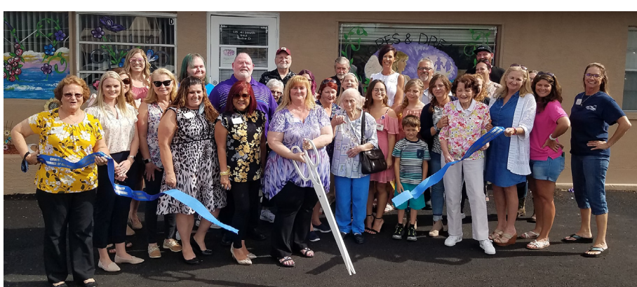
Welcome to the Chamber, Hopes & Dreams! 943 US HWY 41 S, Inverness. Hopes & Dreams delivers high quality in-home care. We treat each and every client with genuine compassion, kindness and respect.