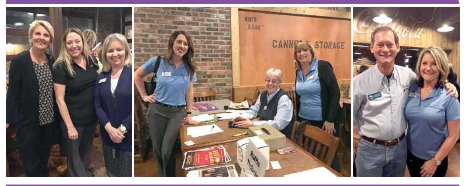
Lunch MOB at Legends at Paradise Valley Sports Bar & Grill and JJ Fish and Chicken