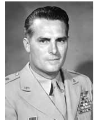
Brig. Gen. Robert Falligant Travis

Fairfield-Suisun Army Air Base began ferrying occupation troops to Japan and returning liberated POWs to the USA. Flying activity at Fairfield-