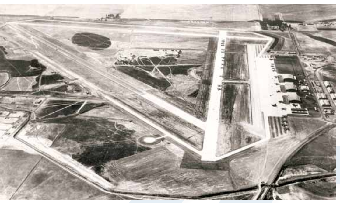
The runways were completed at Fairfield-Suisun Army Air Base on June 1, 1943.