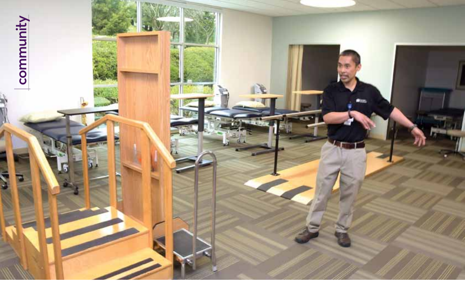
Physical and occpational health share a 6,400-square-foot space that includes private treatment rooms, exercise equipment and treatment tables.