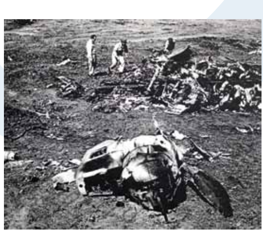
The wreckage of the crash that killed Brig. Gen. Robert Travis at Fairfield-Suisun Air Force Base in 1950.

Fall 1945 : Following Japan's surrender, C-54 aircraft from