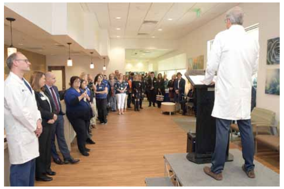
NorthBay Healthcare's Center for Orthopedics and Rehabilitation, 2500 Hilborn Road, in Fairfield .

elebrating an improved patient experience with fanfare, balloons, speeches and tours, physicians, staff, board members and invited guests heralded the opening of NorthBay Healthcare's Center for Orthopedics and Rehabilitation, 2500 Hilborn Road in Fairfield on March 15.