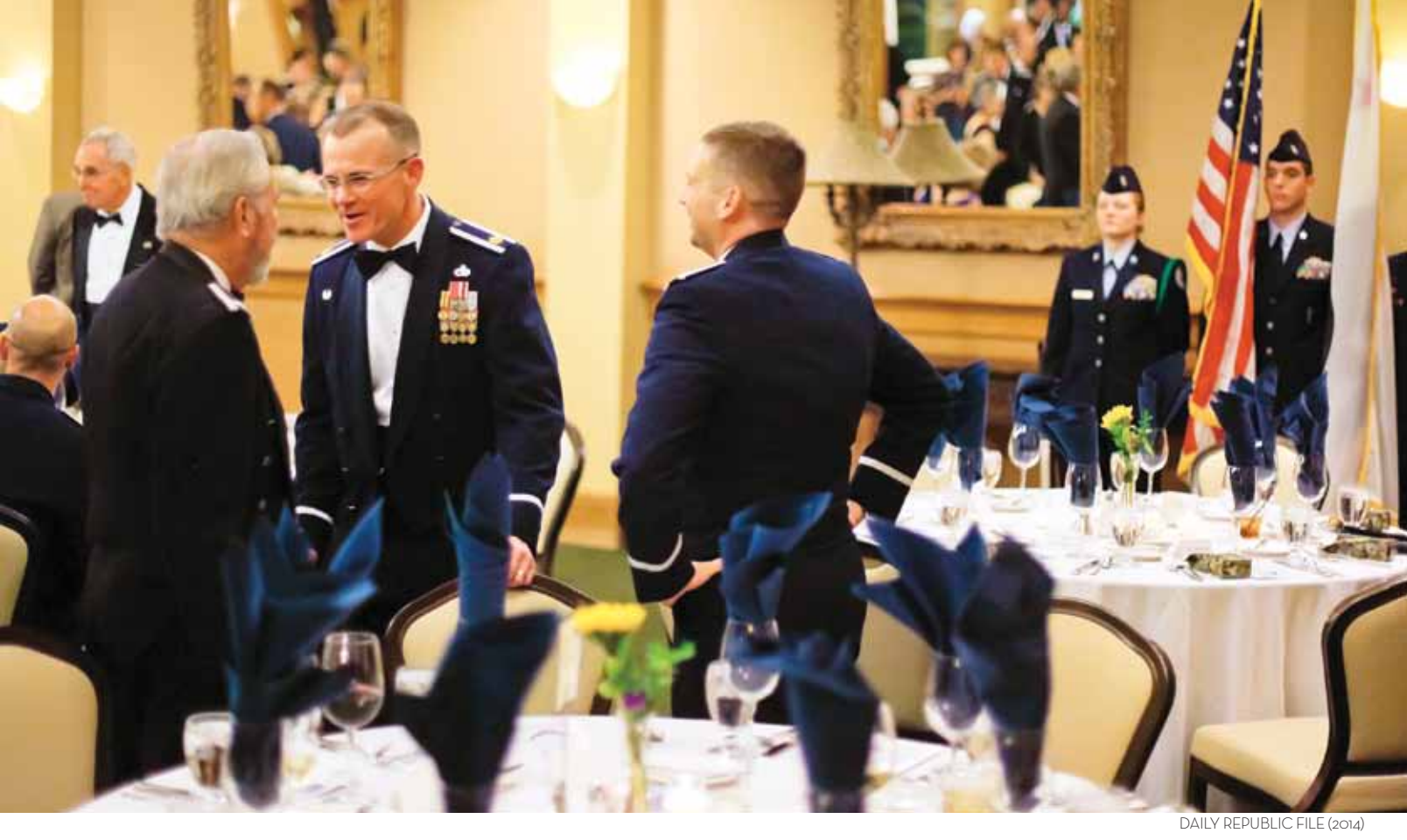
Attendees socialize at the 38th Annual Military Recognition Night that took place at Green Valley Country Club in Fairfield, Nov. 14, 2014.