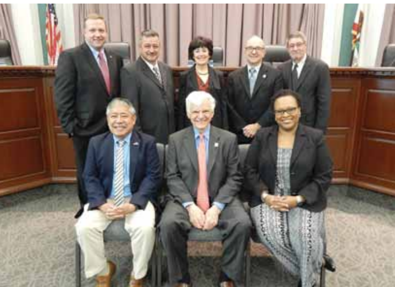
The Solano Transportation Authority board includes all seven Solano County mayors and a representative from the board of supervisors.

years, was accomplished in large part because of the work done by the Solano Transportation Authority.