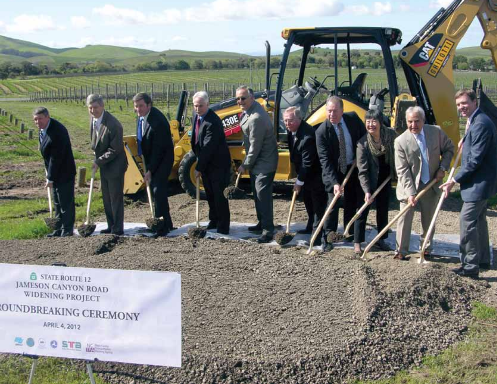
Dignitaries break ground at on Highway 12 for the Jameson Canyon Road widening project in 2012.