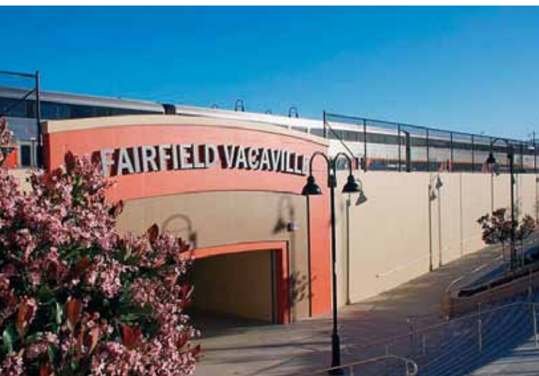
The Fairfield Vacaville Train Station on Peabody Road opened in 2018.