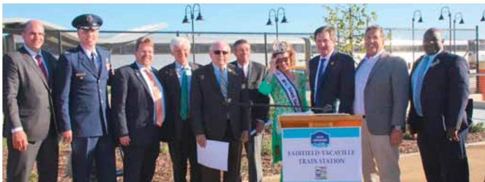
Assemblyman Jim Frazier, second from right, was one of the dignitaries at the grand opening of the Fairfield Vacaville Train Station on Peabody Road, April 19, 2018.

Assemblyman Jim Frazier (D-Discovery Bay) has represented the 11th Assembly District since 2012. He is chair of the Assembly Transportation Committee and the Assembly Select Committee on Intellectual and Developmental Disabilities. The 11th Assembly District encompasses a large cross-section of the Delta in Central Solano, Eastern Contra Costa and Southern Sacramento counties, and includes the communities of Antioch, Bethel Island, Birds Landing, Brentwood, Byron, Collinsville, Discovery Bay, Fairfield, Isleton, Knightsen, Locke, Oakley, Pittsburg (partial), Rio Vista, Suisun City, Travis Air Force Base, Vacaville and Walnut Grove. His website is at https://a11.asmdc.org . He is on Facebook @AsmJimFrazier. ♦