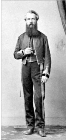
Colonel Richard Moody

The development of the Coquitlam, Port Coquitlam, and Port Moody region began with the British Columbia gold rush of 1858. In that year, Colonel R.C. Moody arrived at Mary Hill with 400 Royal Engineers to establish a provincial capital city. This site was rejected in favour of New Westminster for defence reasons.