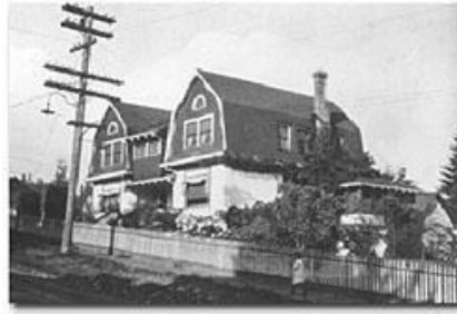
Ryan House – 1908