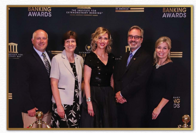
RECOGNIZED AS ONE OF THE TOP 50 EXTRAORDINARY BANKS IN THE NATION - INSTITUTE OF EXTRAORDINARY BANKING