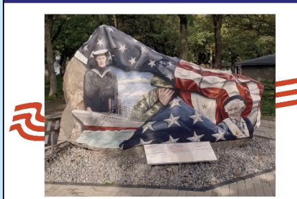
Lakeside Park, Big Lake

Want to be part of the next group of pavers that will be engraved and ready for viewing next month? **DREWA BLAKE** U.S.S. MAY'T 1977-1961**