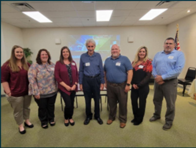
Leadership Lawrence County 2021-22