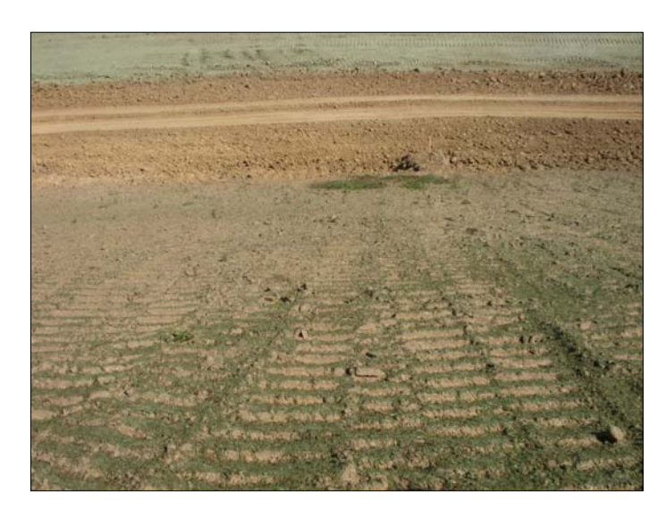
Figure 8: This Site Shows Shadowing on the Hillside.

they are not sprayed in opposing directions, a "shadowing" effect may occur. Ideally, the HECP will be applied from the toe of the slope and from the top of the slope. However, this is not practical for all projects due to access feasibility. It is acceptable for when the contractor does not have access to both the top of the slope and bottom of the slope for the contractor to apply the HECP from locations for which they have access. For such scenarios, the contractor can spray forward and then backward as their hydraulic seeding machine proceeds parallel to the slope.