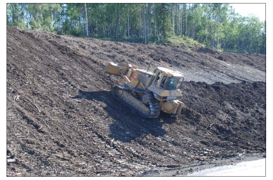
Figure 2: Embankment and Fill Areas Should be Rolled with a Crimping or Punching Type Roller or Track Walked so that Track / Cleat Marks from the Equipment Form an Indentation on the Slope that is Parallel to the Contour of the Slope (Perpendicular to the Flow of Water Moving Down the Slope).

Site reconnaissance and data collection is important to engineer the project appropriately. The designer should use the data collected when developing the project. Examples of site data needed would include a soil test, recording local vegetation (type, species, and density), whether