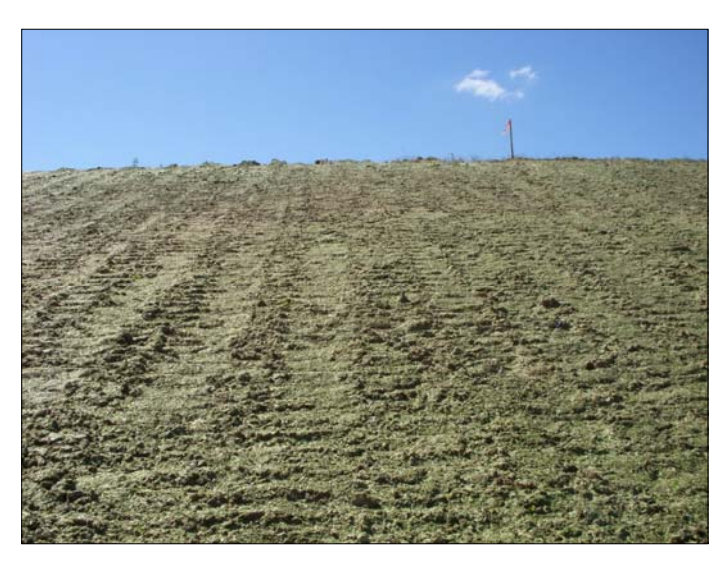
Figure 9: This Site Has No Shadowing on the Hillside.