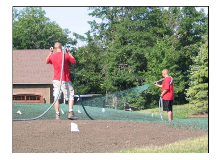
Figure 6: An Example of the Hose Technique.

Step Six: Determine the HECP Application Equipment. There are two techniques for applying HECPs: the tower technique and hose technique. Both have their advantages and disadvantages. The tower technique is often used for hard-to-access locations such as very steep slopes. The tower technique will also allow the hydraulic seeding machine to cover an area at a quicker rate thus reducing the installation time as compared to the hose technique and RECP. However, the hose technique allows for greater control when applying the HECP. For example, when the