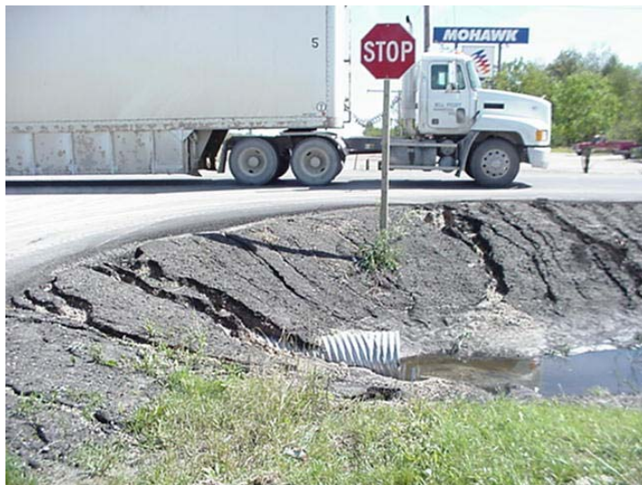
Soil erosion is a leading cause of water pollution.