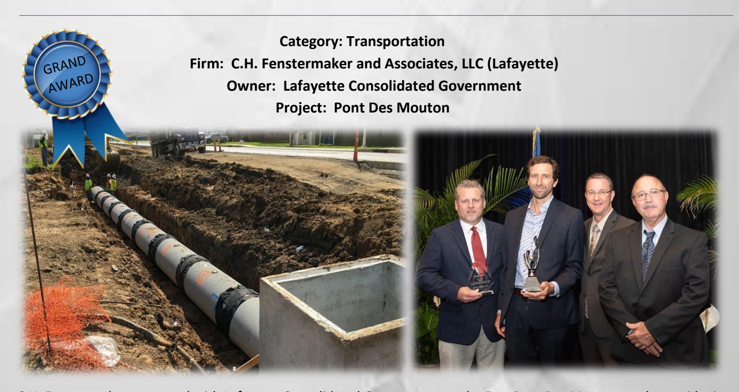
C.H. Fenstermaker partnered with Lafayette Consolidated Government on the East Pont Des Mouton roadway widening and water/sewer design project to increase the capacity of a corridor that grew from 2,700 daily vehicles to 12,600. Along with increasing drinking water capacity, fire protection access and sewer collection, this project enhanced traffic flow and preserved three heritage class live oak trees dating over one hundred years old.