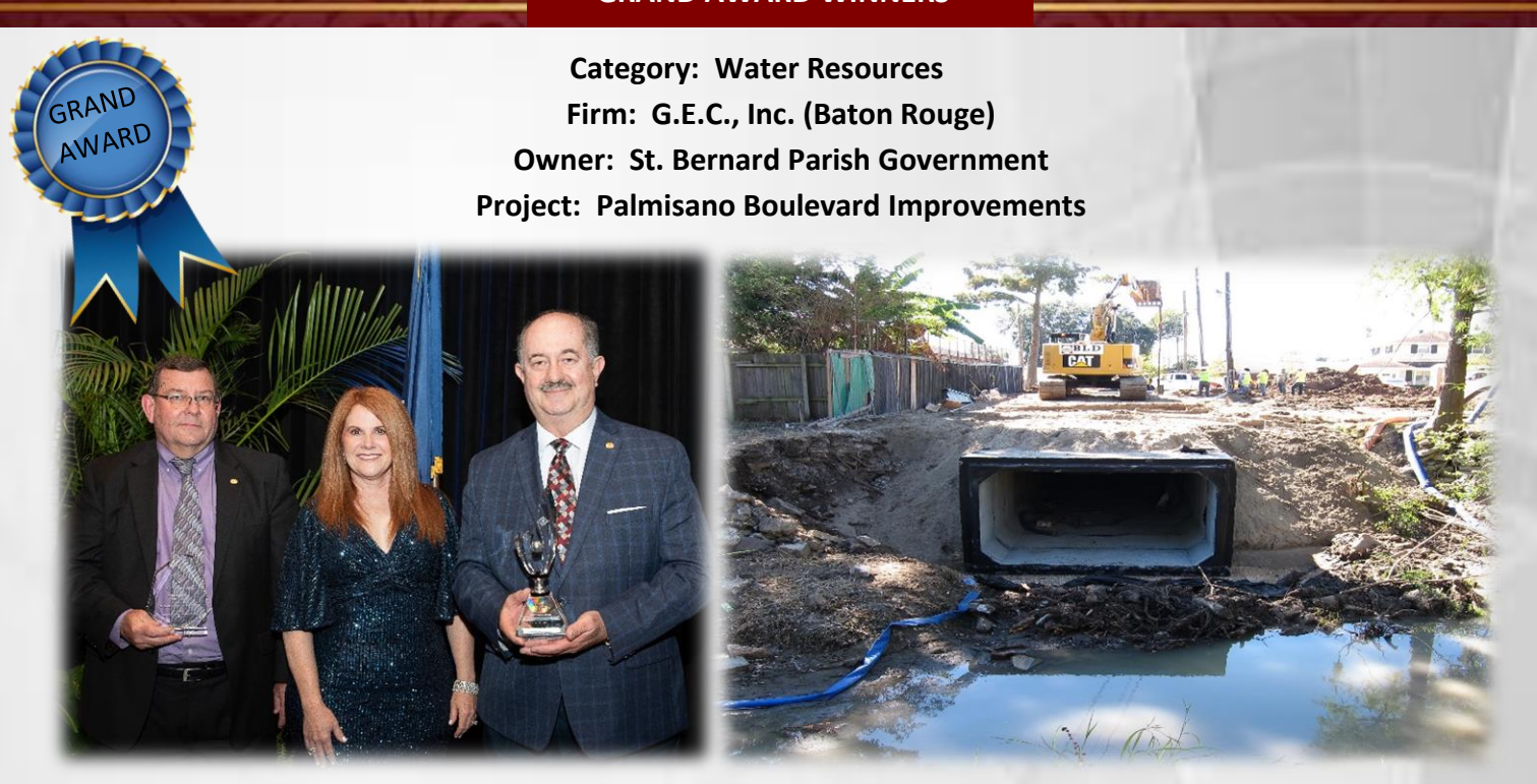
G.E.C. Incorporated, selected by the St. Bernard Parish Government, designed a subsurface drainage improvement project utilizing the ground above the newly enclosed box culvert drainage system for a multi-use path in accordance with the parish's Bikeway & Pedestrian plan and Complete Streets policy.