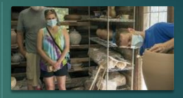
Seagrove Pottery Community