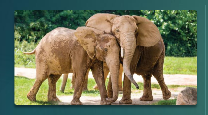
North Carolina Zoo Asheboro, NC