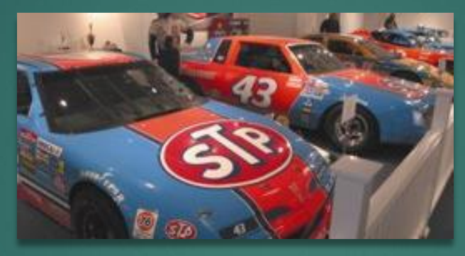
Petty Family Attractions