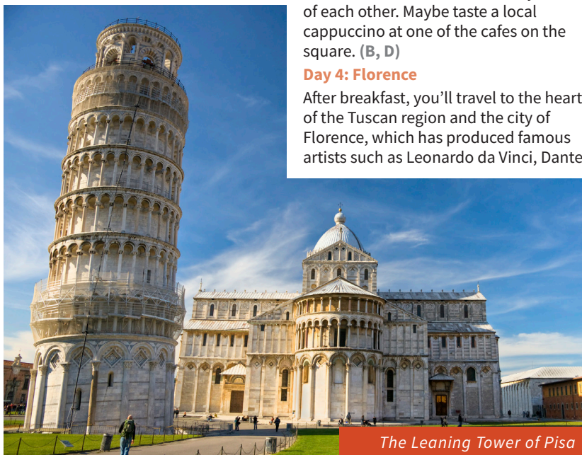
The Leaning Tower of Pisa