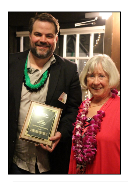
Business of the Year Colorado Party Rentals